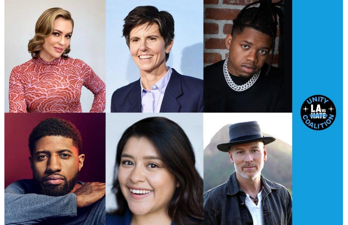
Hollywood-backed Unity Coalition supporting LA vs Hate